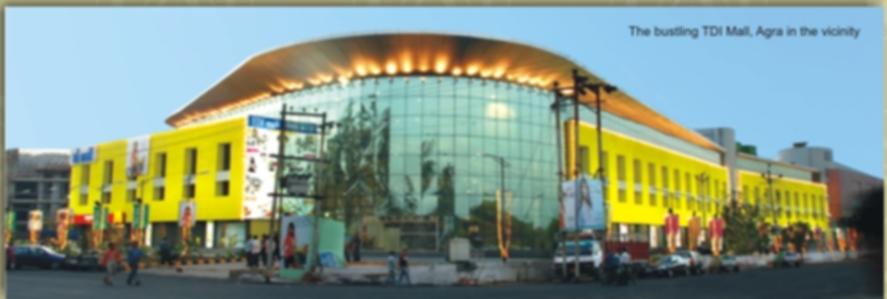
The bustling TDI Mall, Agra in the vicinity